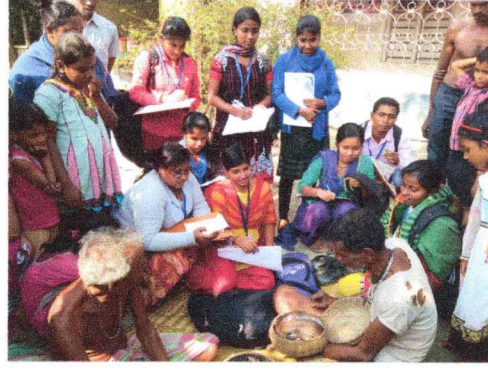
Interactive sessions by UG & PG Students, Dept. of Bengali) with Folk Artisans